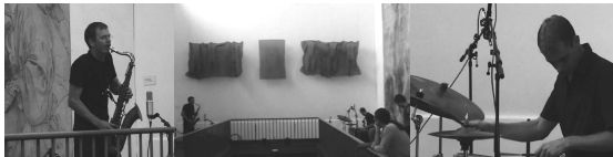
Figure 4: Two musicians improvising along with etherSound at the exhibition The Invisible Landscapes . The saxophonist is one of the authors.