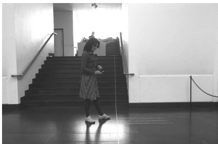
Figure 3: The space at Malmö Konstmuseum where etherSound was first realized.